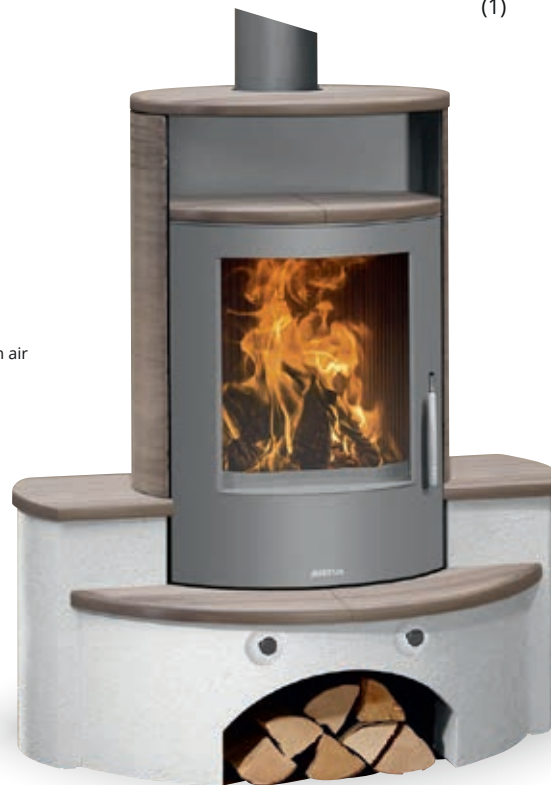
Kaskade 2.0, Ceramic Grappa, corpus steel grey