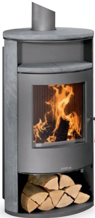
Island Aqua Soapstone, corpus steel black