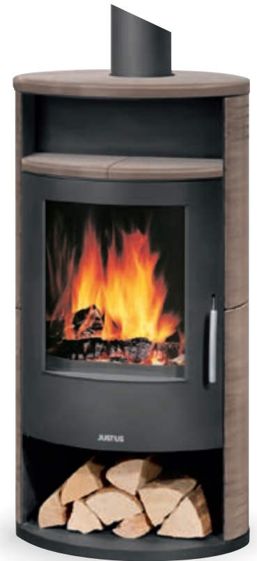
Island 7, Sandstone, corpus steel black