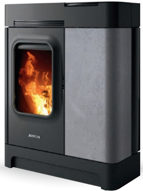
Canis XL, Soapstone

The pellet stove Canis XL can be operated independent of ambient air.